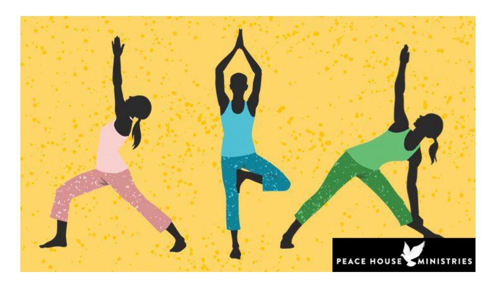
Yoga in the Light

We want to hear from you!! We now have a box located on the table in the hallway for suggestions, prayer requests, and shout outs to anyone at MNS. We look forward to praying for you and learning more about what you think is important at MNS!!