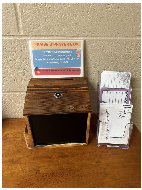
Praise and Prayer Box

We want to hear from you!! We now have a box located on the table in the hallway for suggestions, prayer requests, and shout outs to anyone at MNS. We look forward to praying for you and learning more about what you think is important at MNS!!